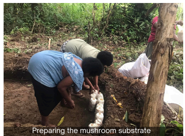
Preparing the mushroom substrate

The development of the DRR Masterplan was supported by Habitat Australia.