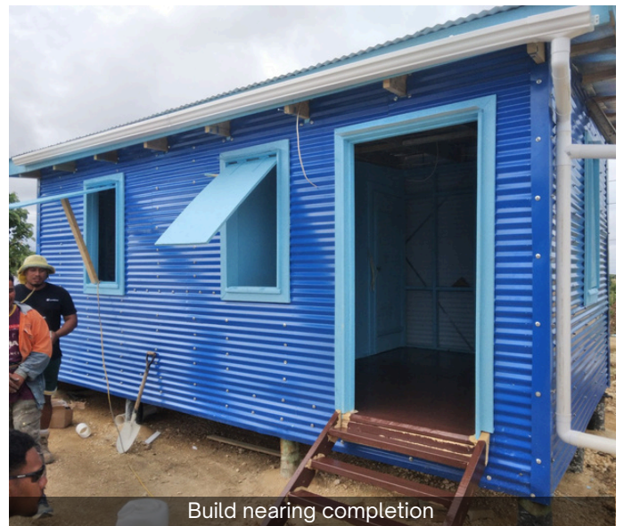
Build nearing completion

Habitat Fiji will continue to provide remote support to Live & Learn for their upcoming community trainings.