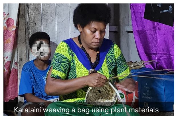
Karalaini weaving a bag using plant materials