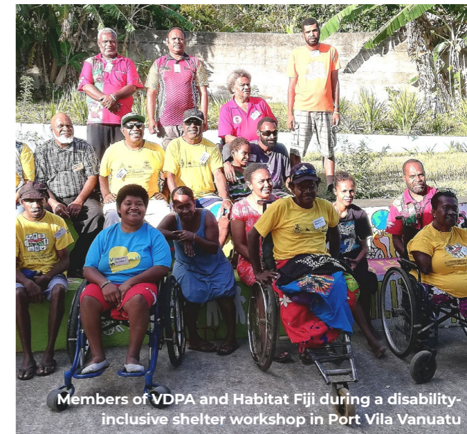
Members of VDPA and Habitat Fiji during a disability-inclusive shelter workshop in Port Vila Vanuatu

their representative organisations, Disabled Peoples Organisations (DPOs). Inclusive and accessible shelter planning seeks to ensure that all people have the same opportunities to access disaster preparedness information, participate in preparedness programs, and to be included as an active stakeholder throughout all stages of the disaster management cycle.