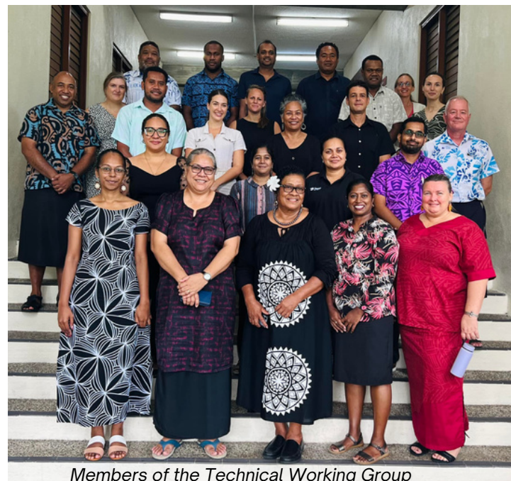
Members of the Technical Working Group

Habitat for Humanity Fiji provides valuable insight in the TWG-HM because of our involvement in community relocation projects, such as Nakanacagi. These projects are essential for helping communities adapt to the impacts of climate change and disasters, ensuring their resilience and sustainability.