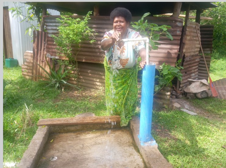
Sainimere Lewalau now benefits from accessible water

With 20 households and 124 individuals, the community relies primarily on surface water sourced from the nearby creek. Habitat Fiji's key intervention included the construction of a new dam, installation of a new reticulation line and stand pipes and installation of an overhanging pipe across the river. The Water Committee was also provided with capacity development training to support the community with the operation and maintenance of the WaSH infrastructure.