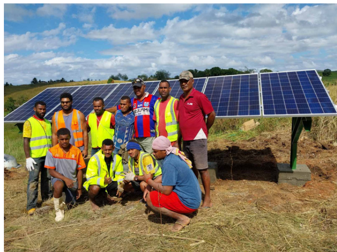
Solar panel installation

HFHF replaced the system with a solar-powered submersible pump and installed two 10,000-liter tanks to increase the secondary water storage capacity. The location of these tanks were also strategically chosen so that the water pressure can support the flow of water. The revitalized Water Committee received comprehensive training on operation and maintenance of the WaSH infrastructure as well as a Financial Literacy training aimed to empower them in the area of sustaining their water systems operation and maintenance costs. HFHF aimed to not only address the physical water challenges but also help restore faith in the management and sustainability of the water infrastructure.