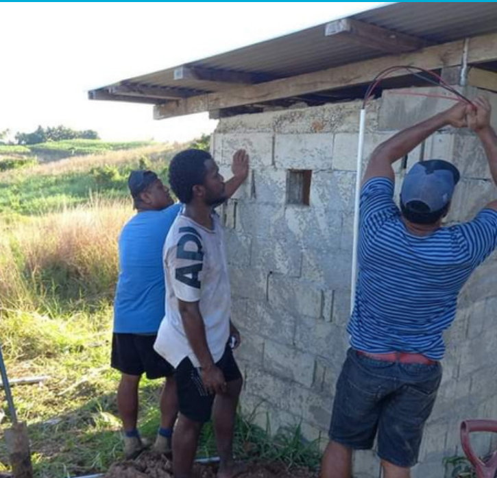
Connecting solar to borehole submersible pump