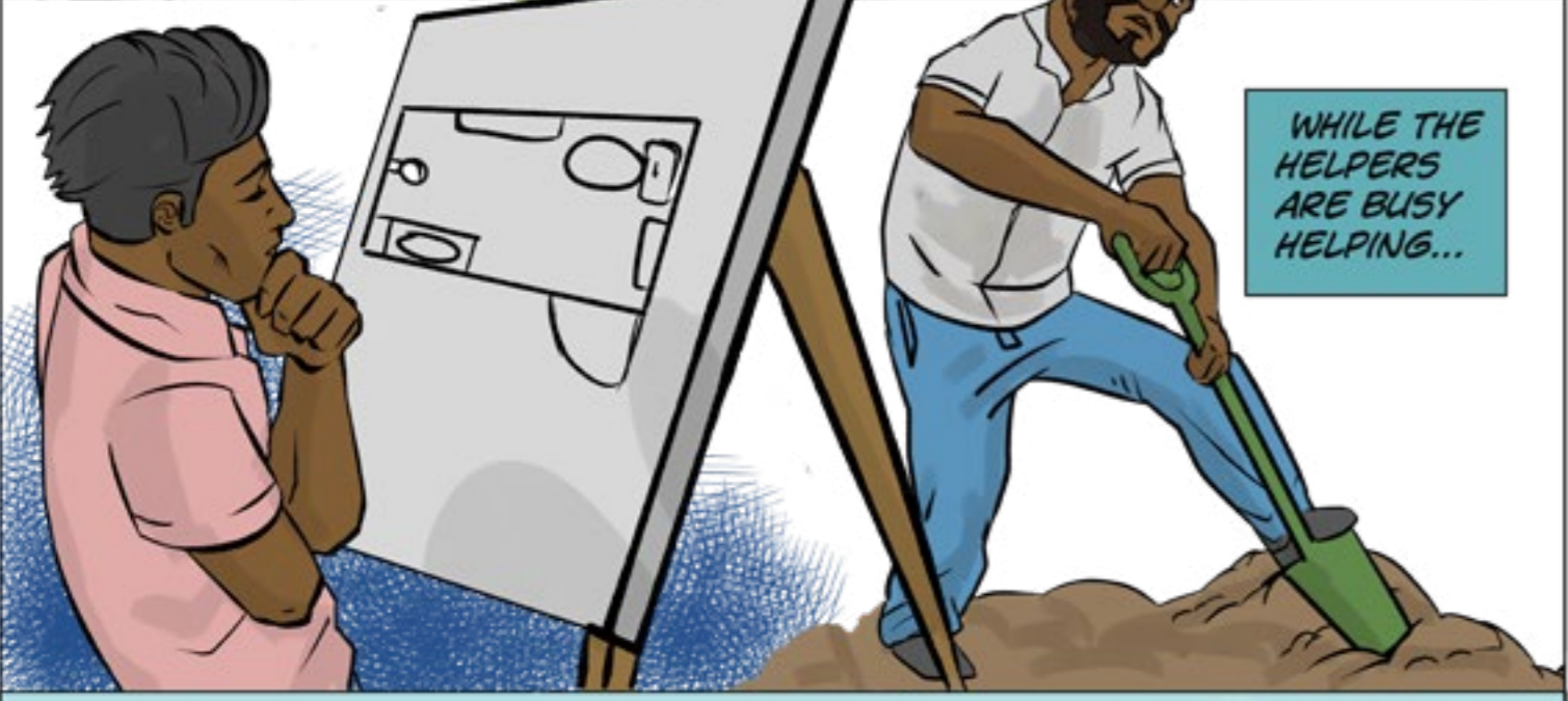
WHILE THE HELPERS ARE BUSY HELPING...