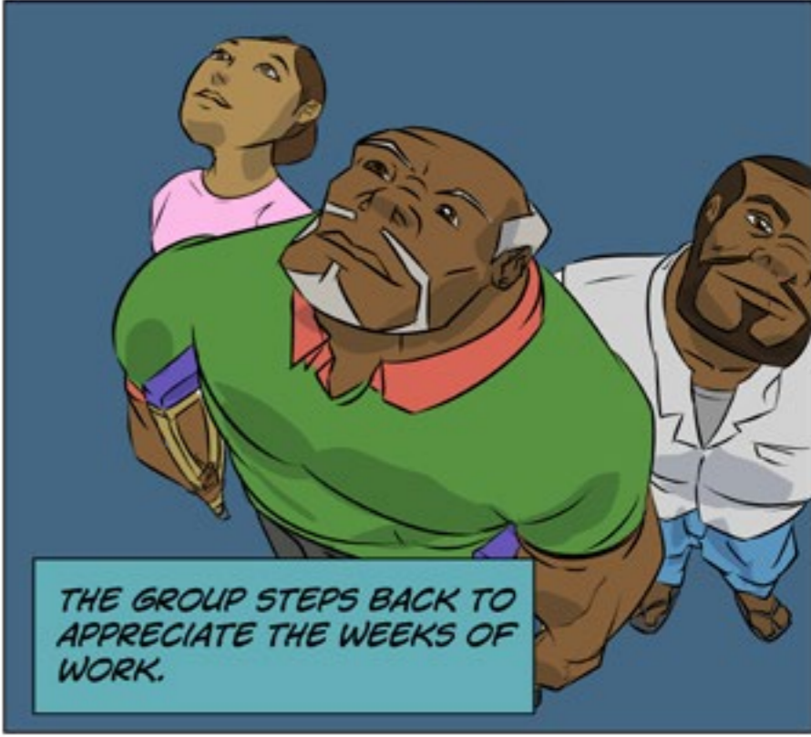
THE GROUP STEPS BACK TO APPRECIATE THE WEEKS OF WORK.