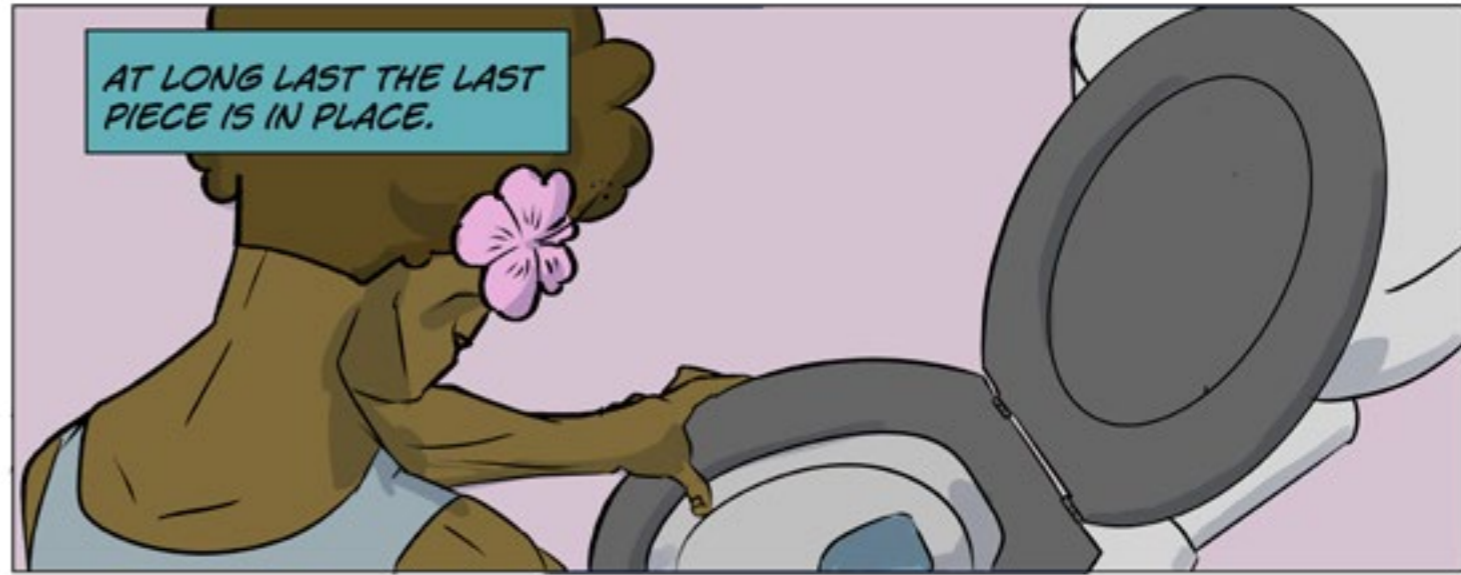
AT LONG LAST THE LAST PIECE IS IN PLACE.